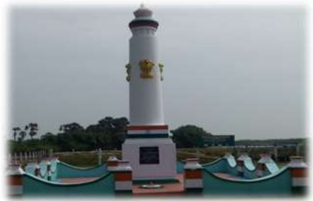
Finishing Point – Vedaranyam