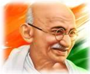
Dandi Yatra – 12 th March 1930

To celebrate the 75 years of Independence