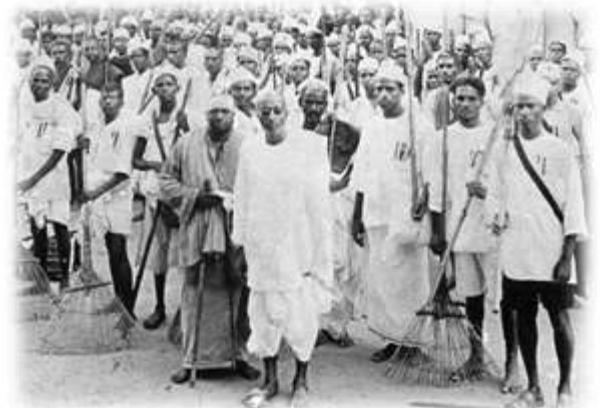
Tiruchirapally to Vedaranyam