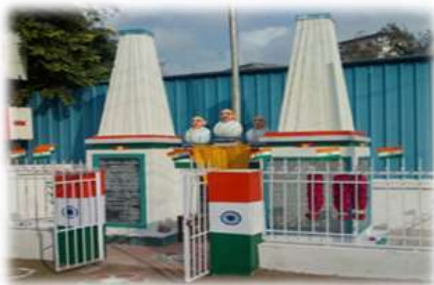
Starting Point – Tiruchirapally