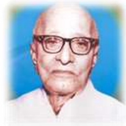
Dandi – Vedaranyam Yatra – 13 th April 1930