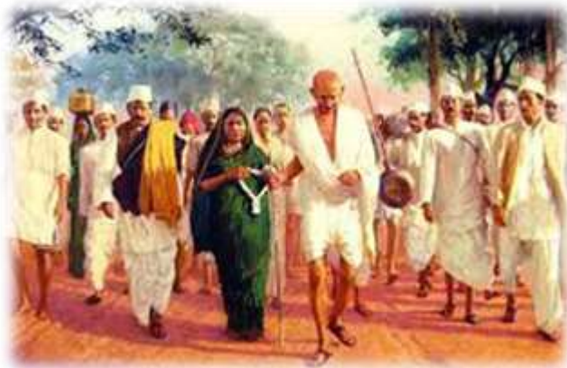
Sabarmati Ashram to Dandi